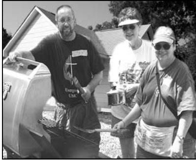
Members of local churches fire up the grill for construction volunteers.