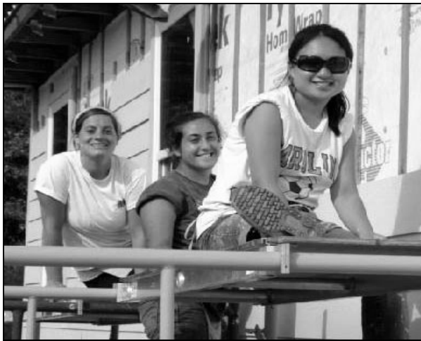
Villanova University students